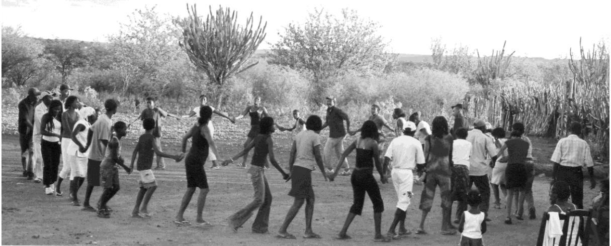
People from a Brazilian Quilombo in Queimada Nova, Piauí, 2006